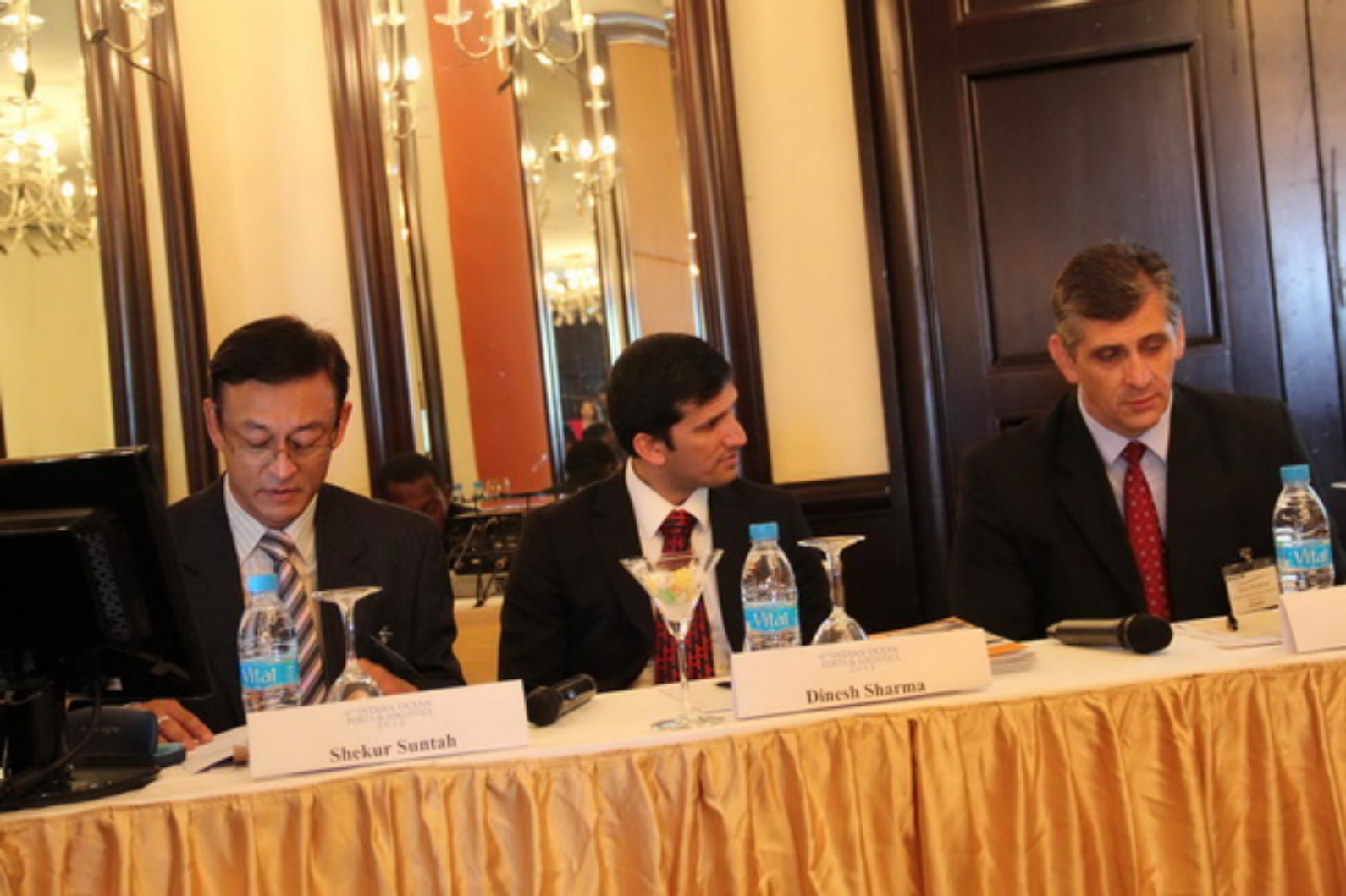
SHREYAS OCEAN PORT & LOGISTICS LTD. Shekur Sintah