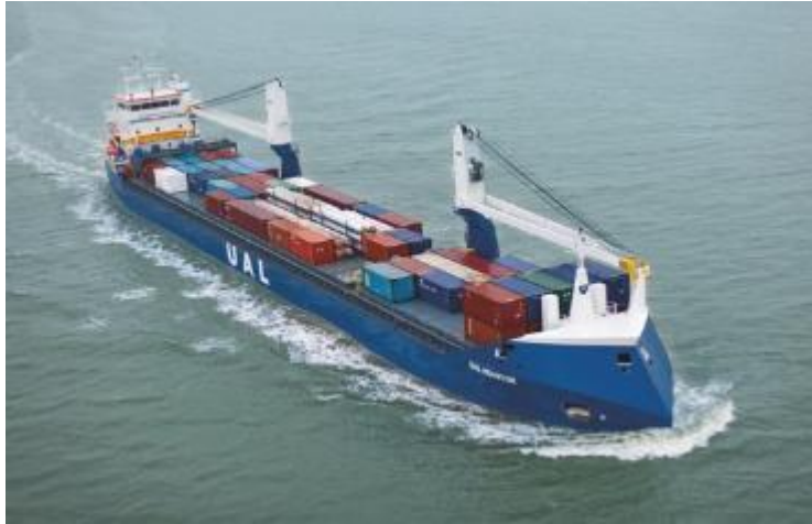
UAL Houston 8250MT