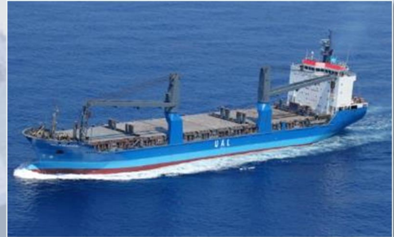
UAL ECO TRADER - UAL AFRICA 8326MT DW