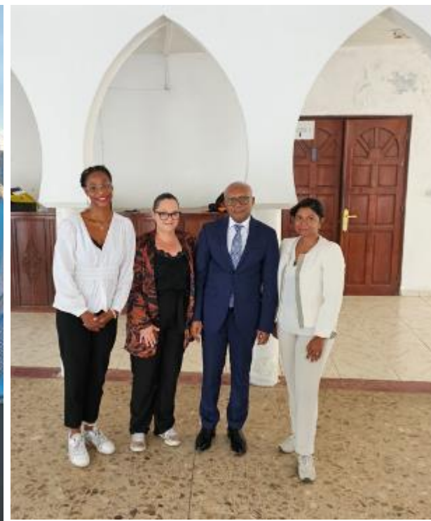
Audience with the Governor of Anjouan