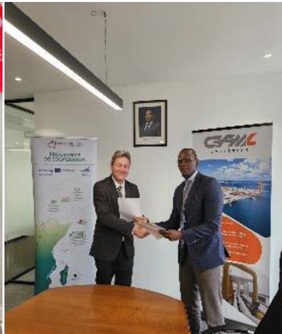
Signing of the CFM Logistics/GPMDLR partnership agreement