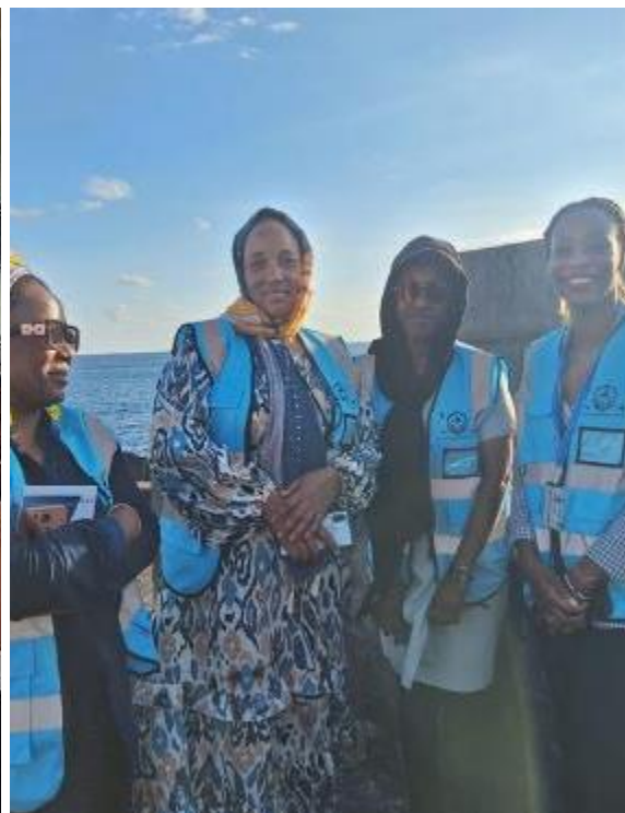
Visit of the port facilities at the Port of Moroni, Grande Comore