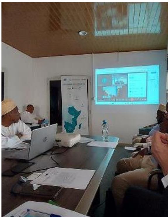
Round table with Comorian Customs, French Customs and Moroni Terminal