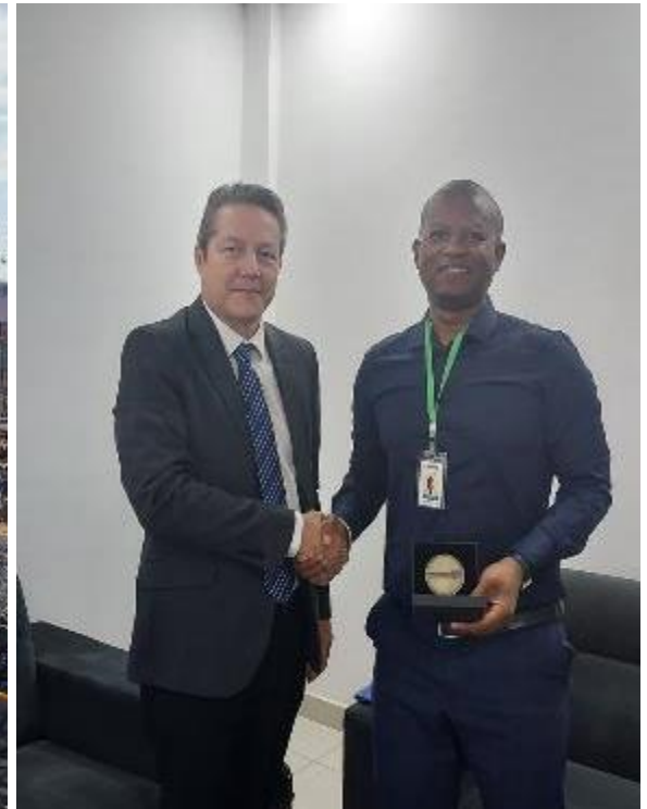
Meeting with the SMMC - Port handling company