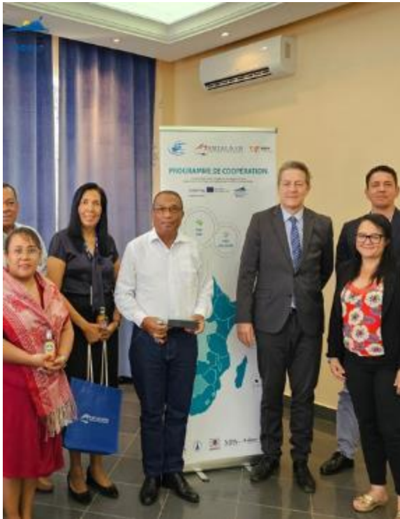
Working sessions on the cooperation programme activities