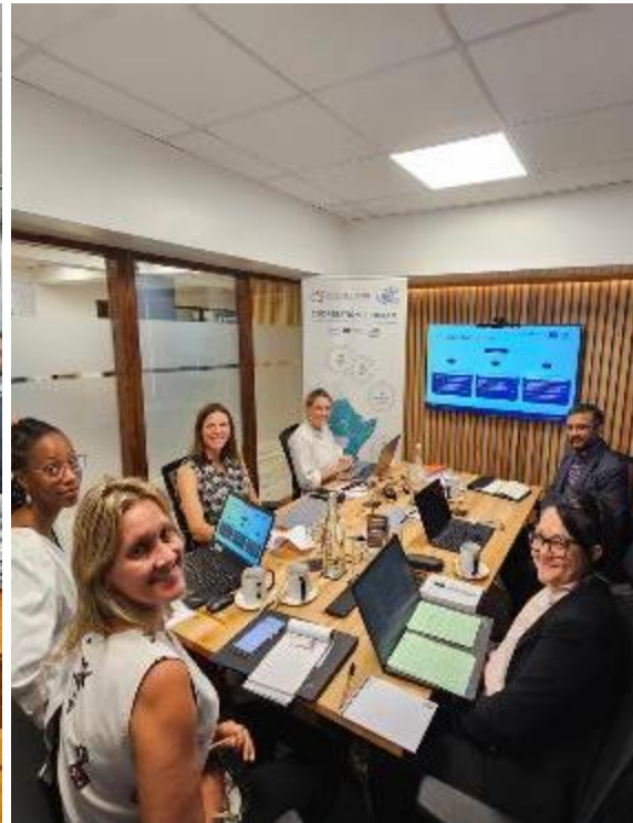
Exchanges with the France-Tanzania Chamber of Commerce