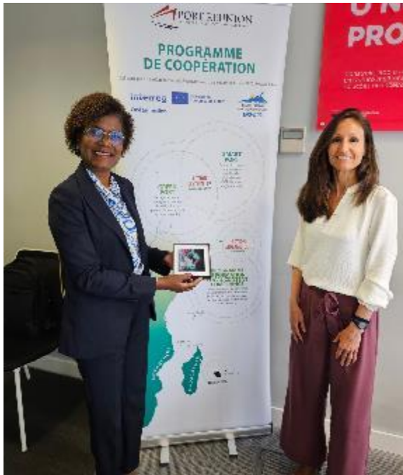
HAROPA PORT - supporting the design of the executive training programme