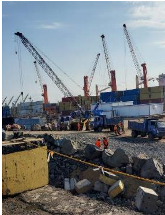
Visit of the SPAT port facilities