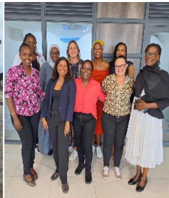
WOMESA / GPMDLR working session