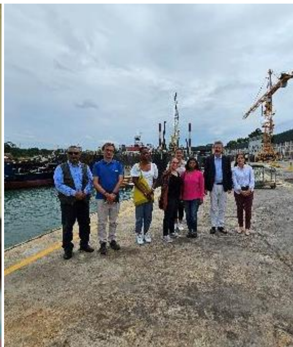
Alpha Logistics / GPMDLR working session