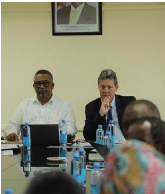
Kenya Port Authority (KPA) / Kenya Maritime Authority (KMA) / GPMDLR working session