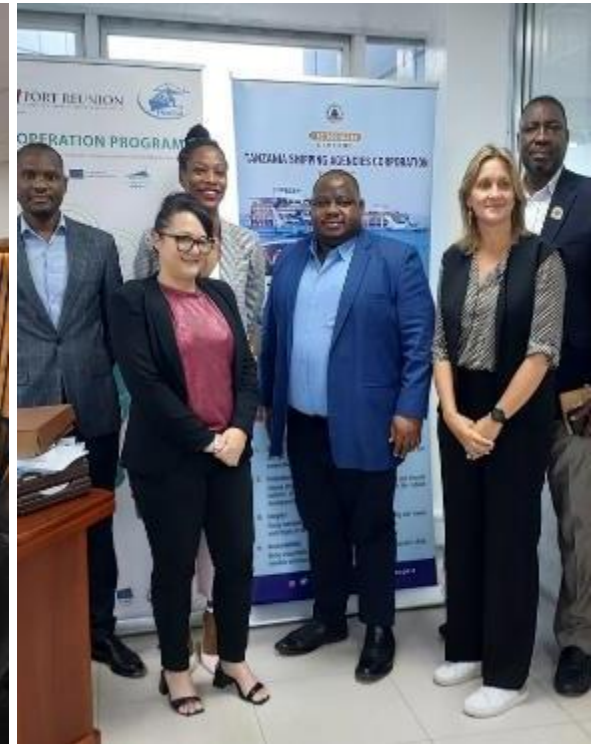
Meeting with the Managing Director of TASAC