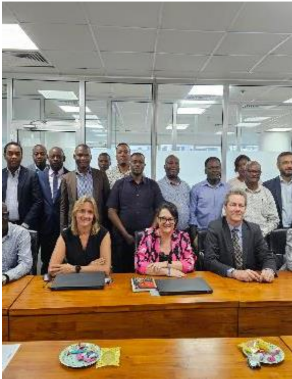
Round table with the port community Dar es Salam