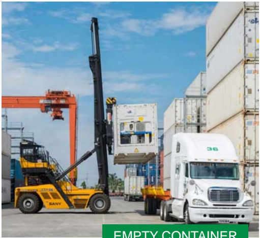
EMPTY CONTAINER HANDLERS