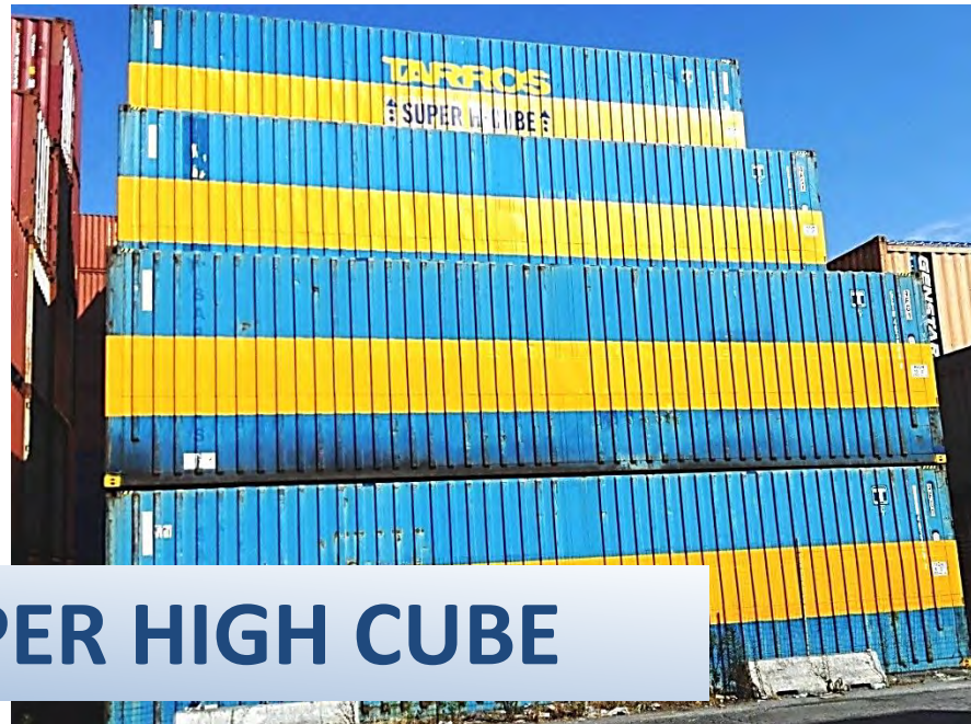
40' PALLET WIDE SUPER HIGH CUBE