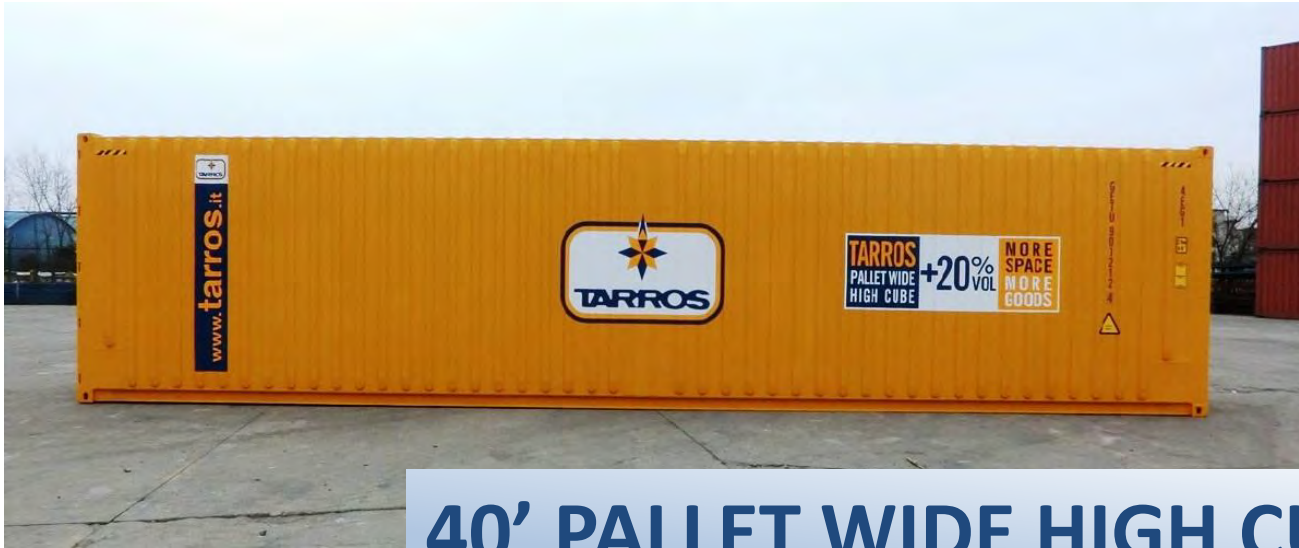
40' PALLET WIDE HIGH CUBE