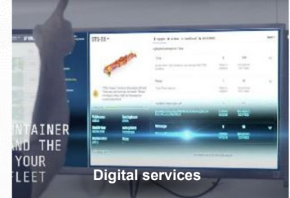
CONTAINER AND THE YOUR FLEET Digital services