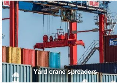
Yard crane spreaders