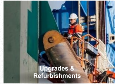
Upgrades & Refurbishments