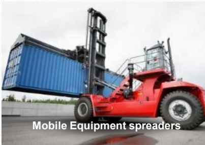
Mobile Equipment spreaders