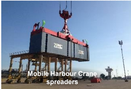
Mobile Harbour Crane spreaders