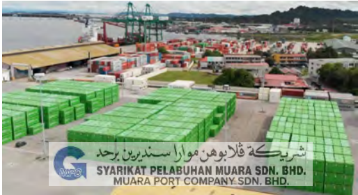
MUARA PORT COMPANY SDN BHD

Muara Port is involved in the logistics, operation, and port-handling services with our expertise.