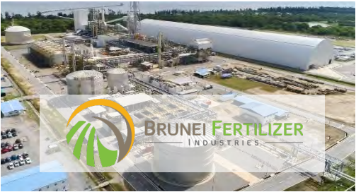
BRUNEI FERTILIZER INDUSTRY