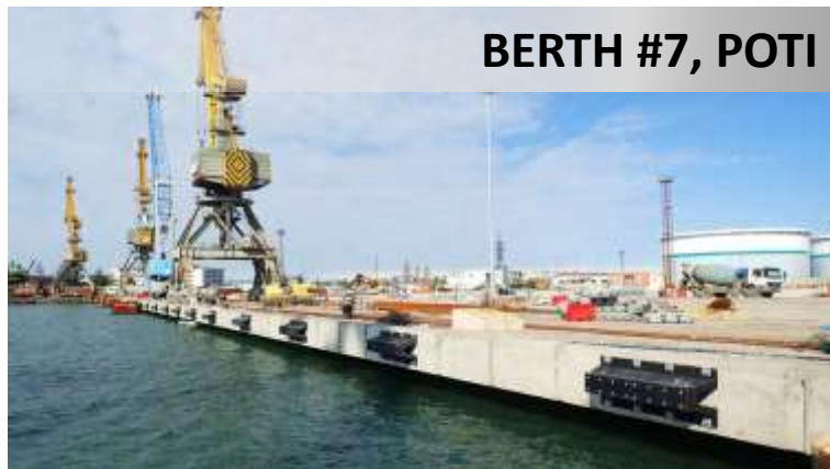
BERTH #7, POTI