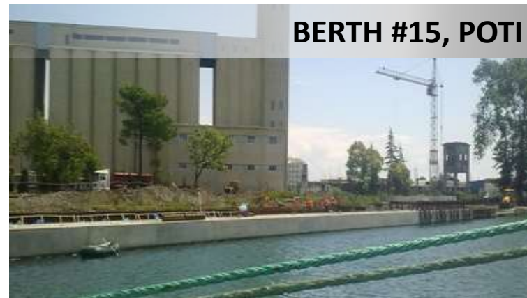
BERTH #15, POTI