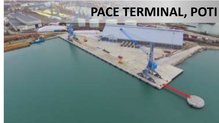
PACE TERMINAL, POTI