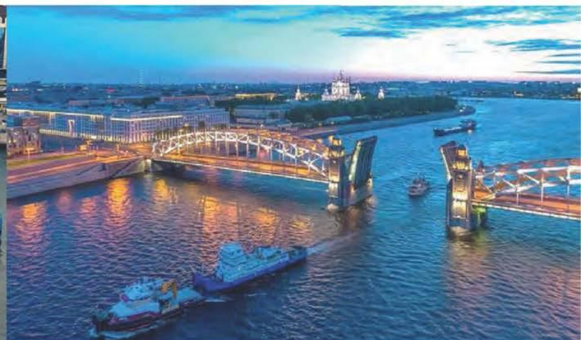
Mobilization of tug «Irgiz» Rotterdam – Bautino