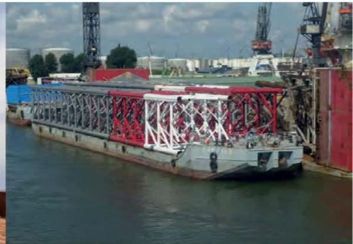
Transportation of drilling rig for British Petroleum from Rotterdam to Baku