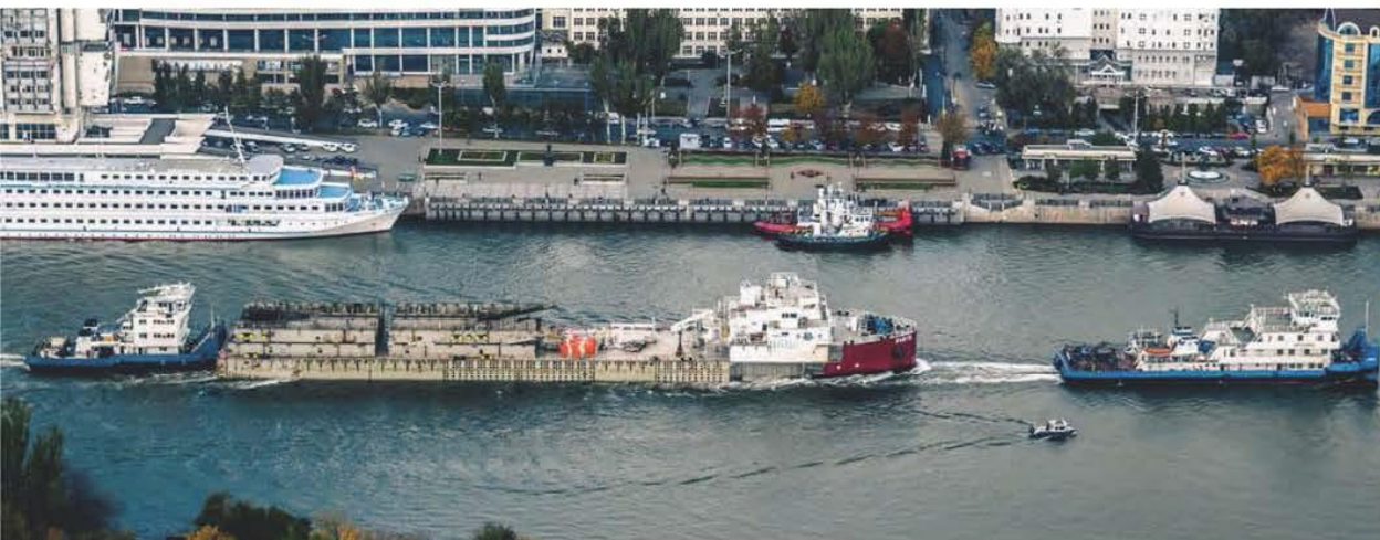
Towage of MCV "Barys" Braila (Romania) – Baku