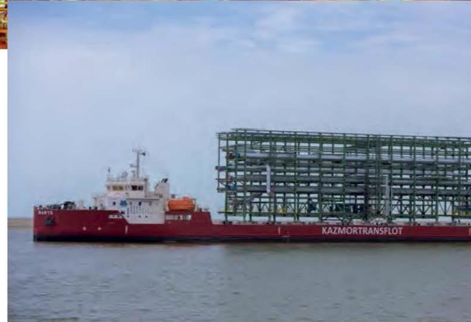
Module R309 on Barys

KMTF passed all audits and inspections for compliance with OVID and Marine Warranty Surveyor requirements;