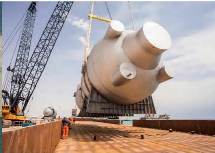
Transportation of oversized cargo for Atyrau Oil Refinery