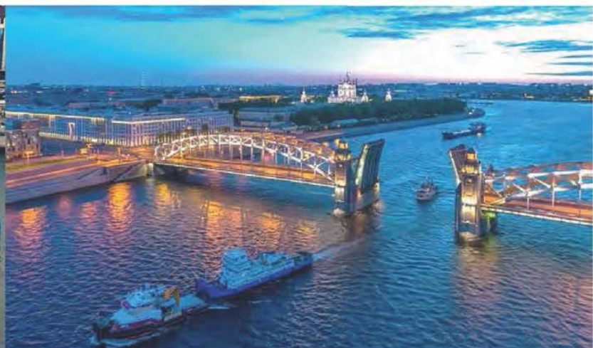
Mobilization of tug «Irgiz» Rotterdam – Bautino