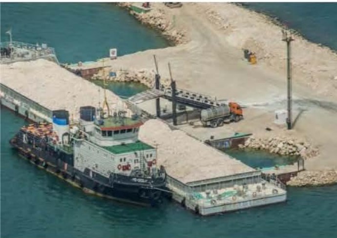
Transportation of stone for the construction of artificial islands