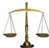
Load sensing system