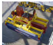
First tandem spreader