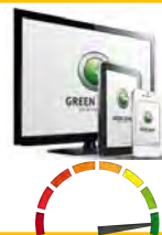
Green Zone for productivity