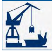
Mobile harbour crane spreaders