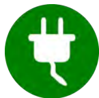
First all-electric Yard spreader