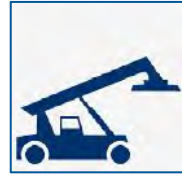
Mobile equipment spreaders