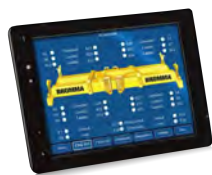
Predicting spreader issues with AI