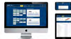
Spreader Monitoring System