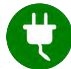
All-electric STS spreader