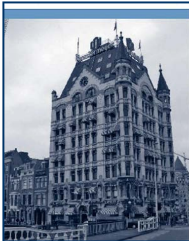
White House, Rotterdam