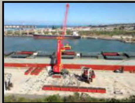
Load Ship at Port