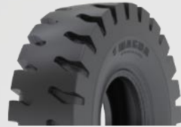
MB02 IND-3 /IND-4

11.00-20 18.00-25 12.00-24 18.00-33 14.00-24