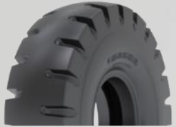
MB01 IND-3 /IND-4