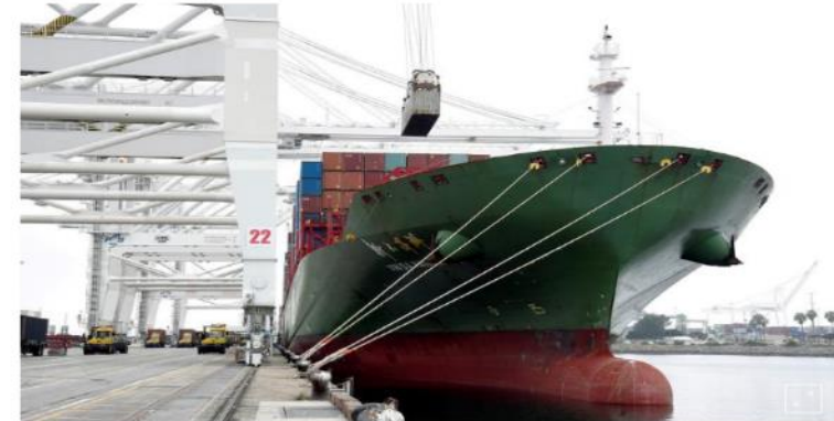
FILE PHOTO: Shipping containers are being loaded onto Xin Da Yang Zhou ship from Shanghai, China at Pier J at the Port of Long Beach in Long Beach, California, U.S., April 4, 2018. REUTERS/Bob Riba 7/File Photo

BRUSSELS (Reuters) - The European Parliament on Tuesday voted in favour of including greenhouse gas emissions from the maritime sector in the European Union's carbon market from 2022, throwing its weight behind EU plans to make ships pay for their pollution.