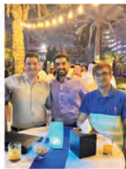
Networking Reception Monday 24 January 2028