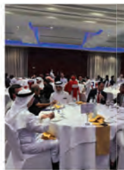
Networking Dinner Tuesday 25 January 2028