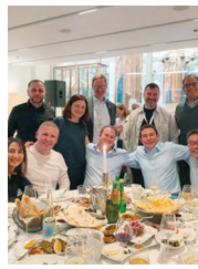
Networking Dinner Wednesday 14 July 2027