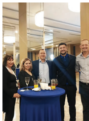
Networking Reception Tuesday 13 July 2027